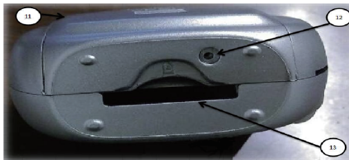
Schematic diagram for corresponding parts